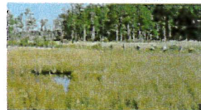
With both short and long trails and many places to stop and enjoy the scenery, Blackwater National Wildlife Refuge is a great place to visit by bike.